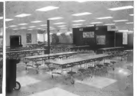
Hononegah High school, Rockton, IL